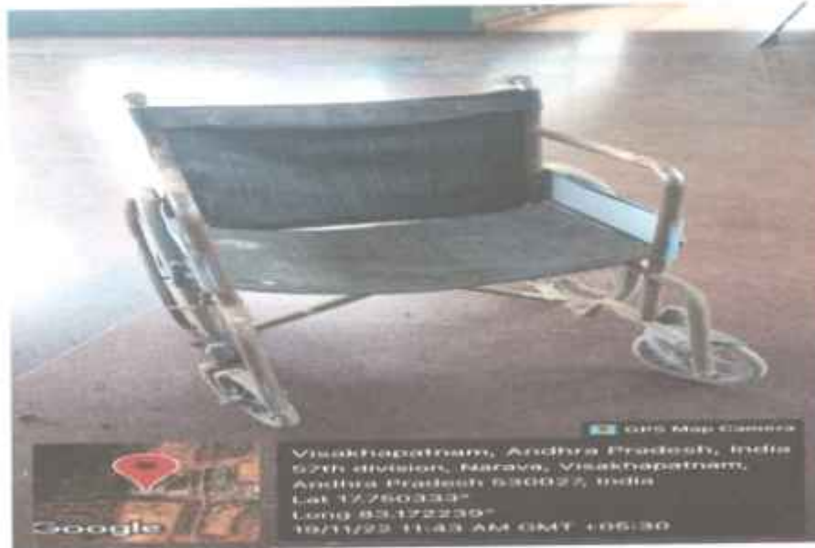
WHEEL CHAIR PROVISION