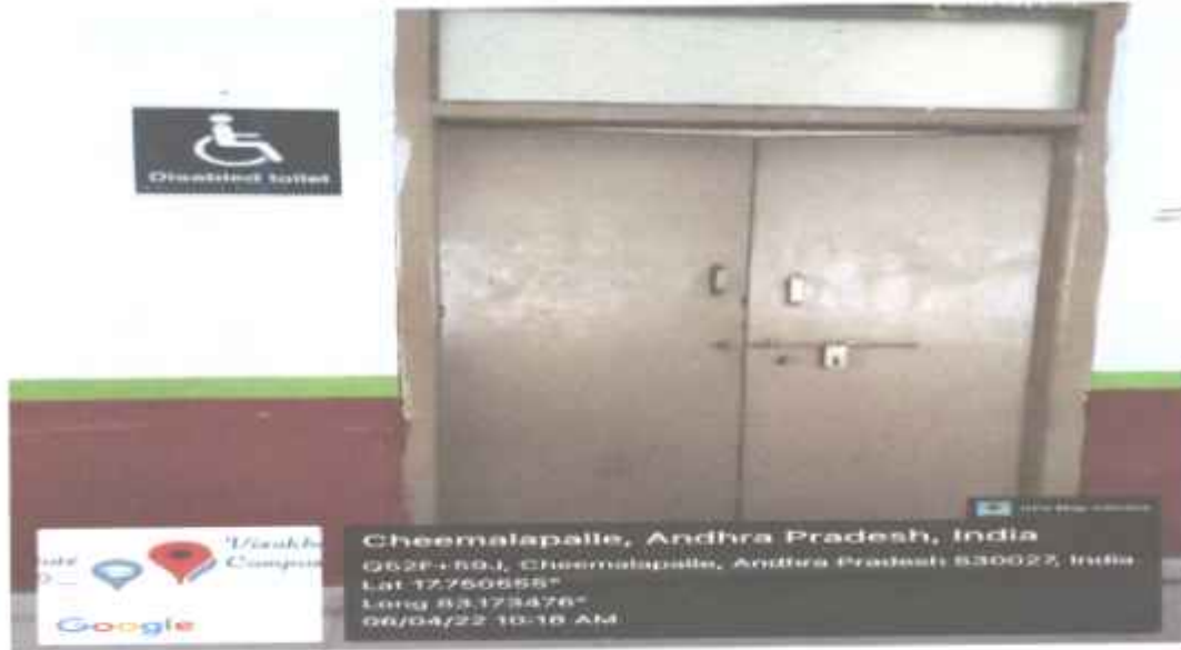
TOILETS FOR DISABLED